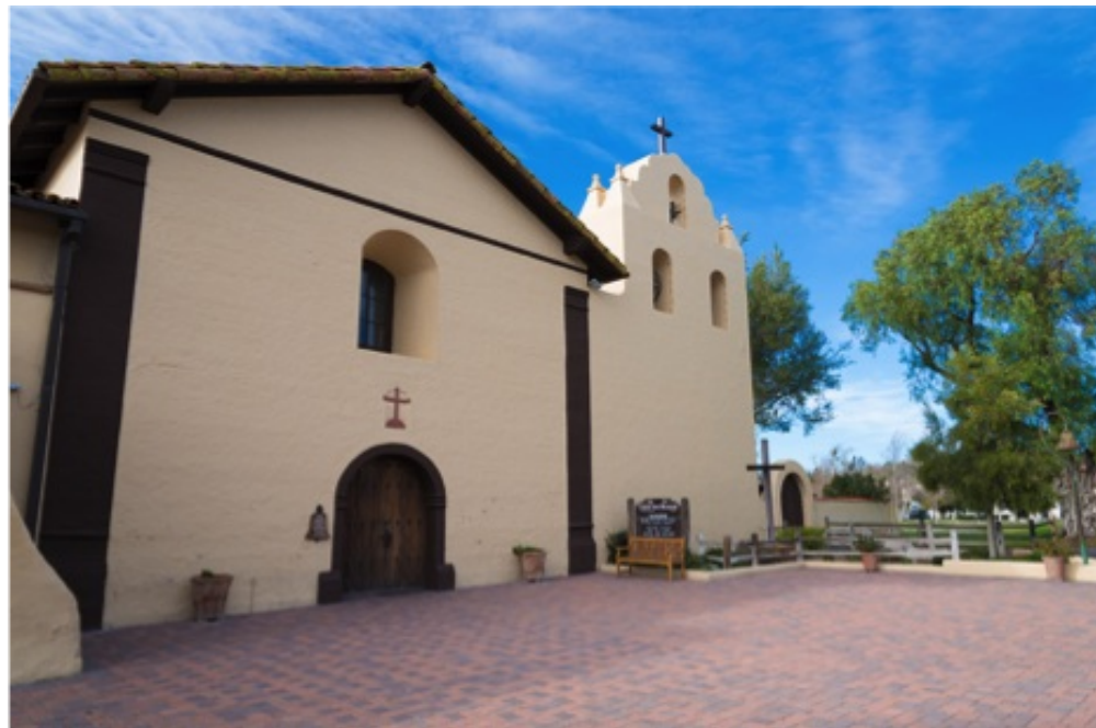
Mission Santa Inés

Friday evening, there will be a hosted reception for attendees, followed by an evening program in the mission church and the annual business and general membership meeting.