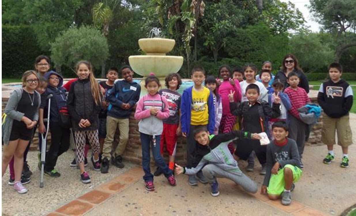
Gates Street Elementary, Los Angeles, visited Mission San Fernando.