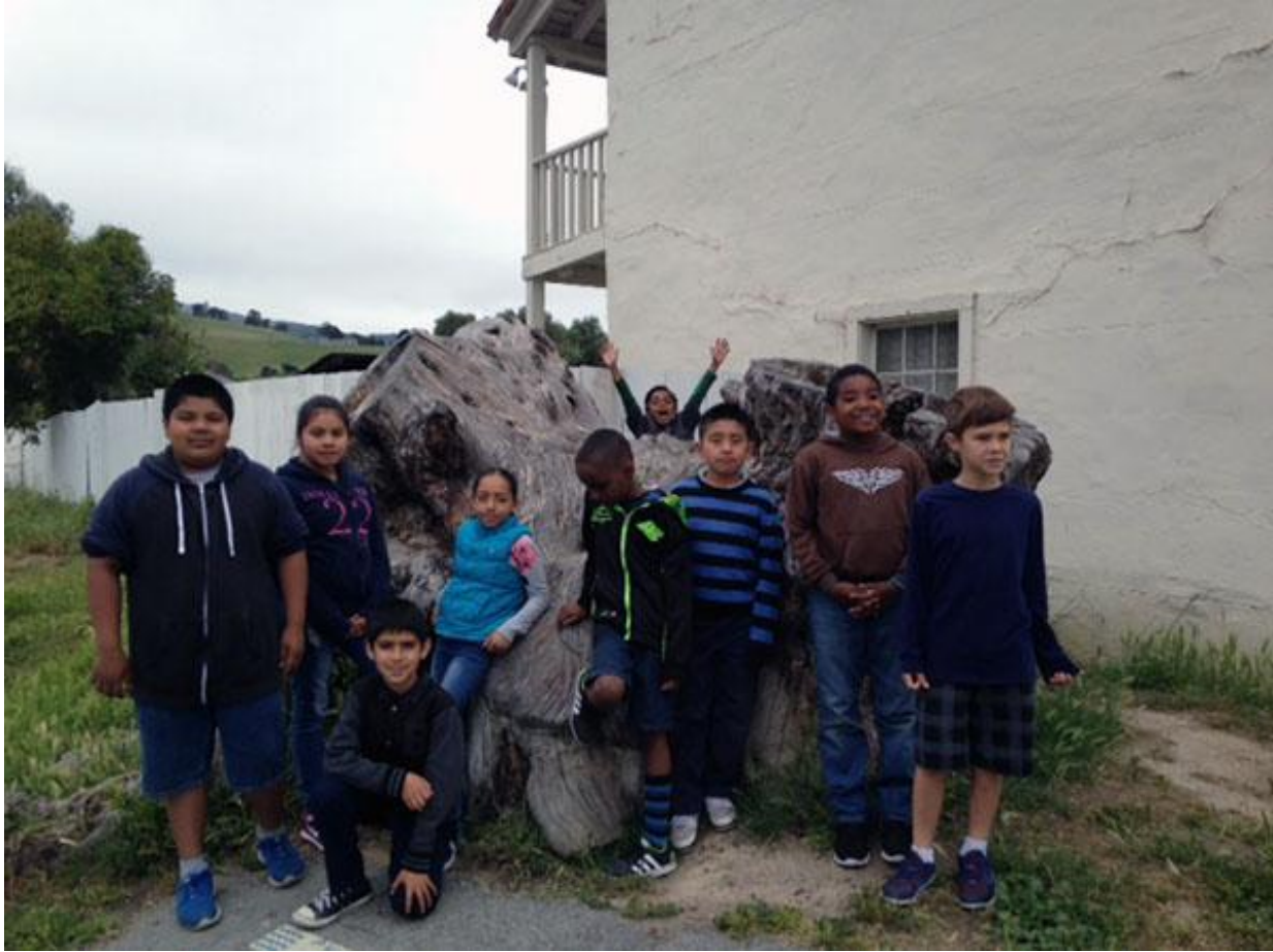
Ord Terrace Elementary, Seaside, visited Mission San Juan Bautista.