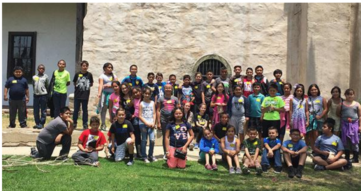
Foster Road Elementary, La Mirada, visited Mission San Gabriel