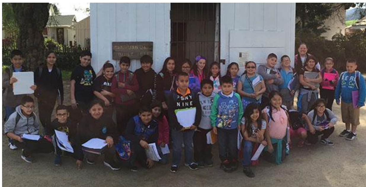
Cesar E. Chavez, Salinas, visited Mission San Juan Bautista.