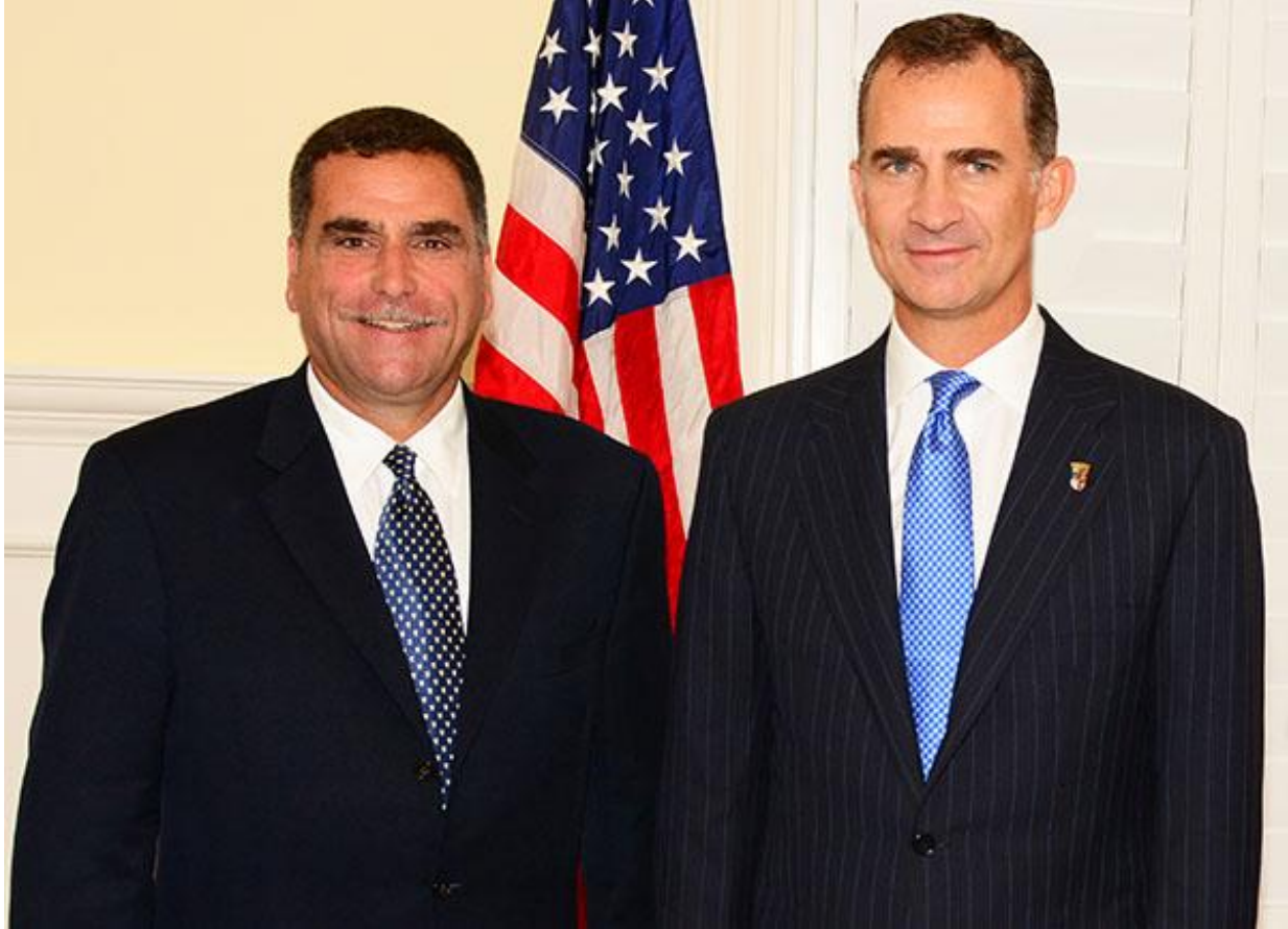
At the US-Spain Council Forum with Spain's king, His Majesty Felipe VI.