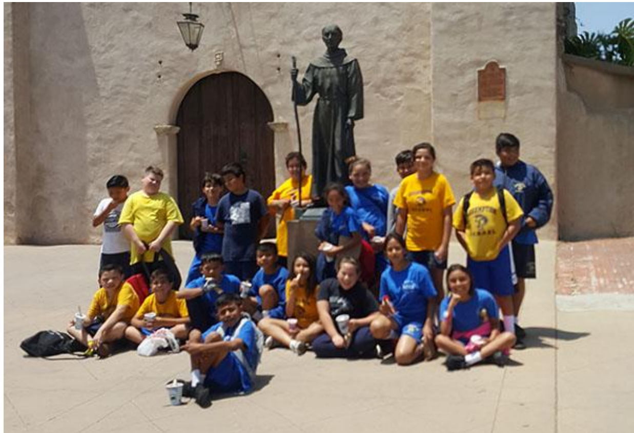
Assumption School, Los Angeles, visited Mission San Gabriel.

Please consider contributing to the CMF Education Fund by clicking here , and please be sure to add "AATB" to the notes section on PayPal.