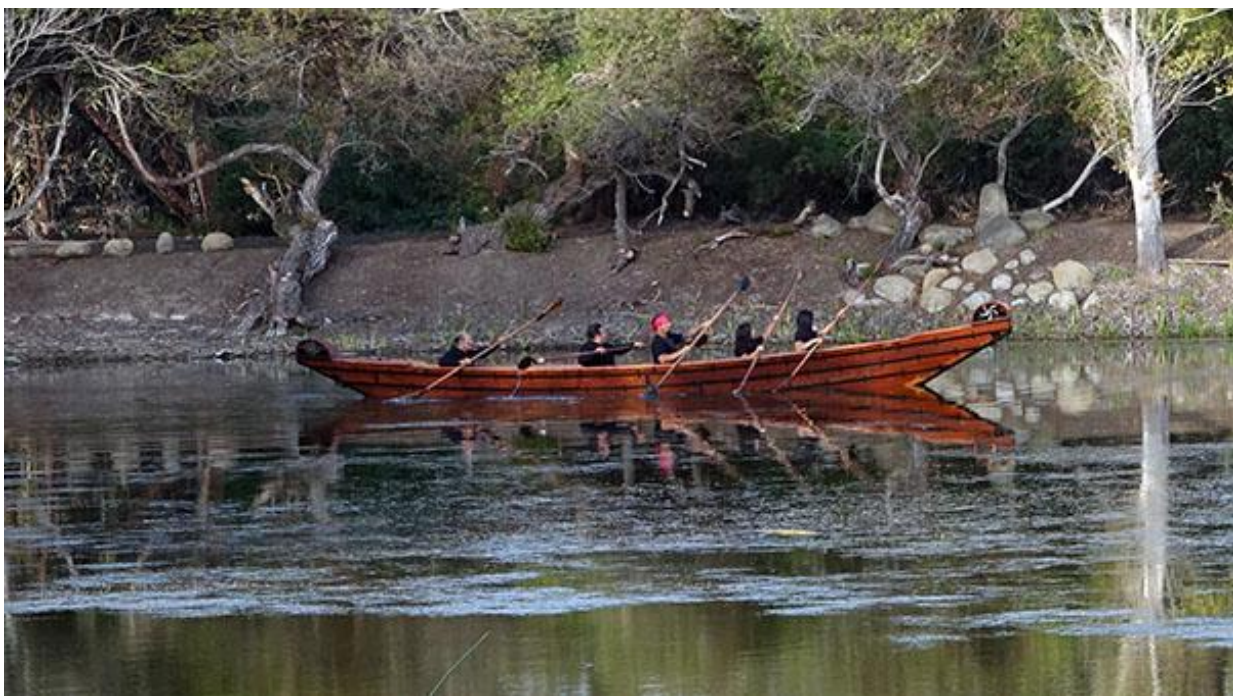
Members of the Coastal Band of Chumash paddle a Tomol.