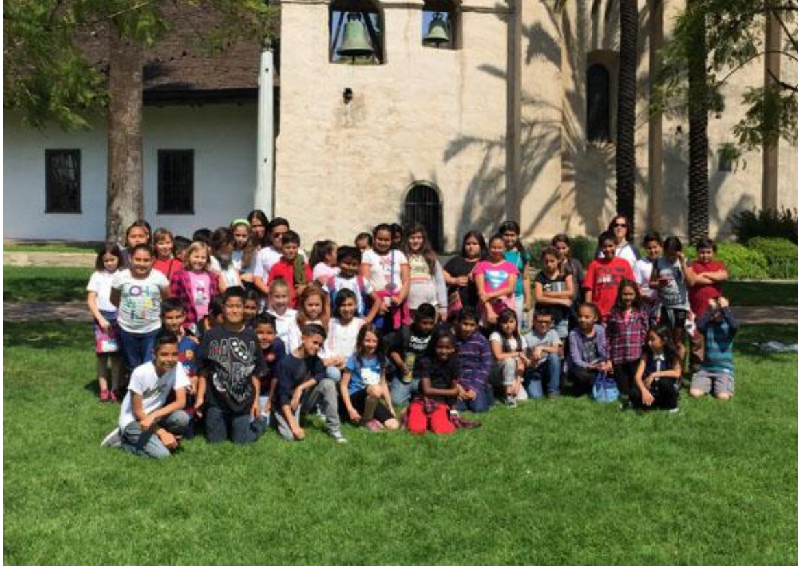
Dominguez Elementary, Carson, visited Mission San Gabriel.