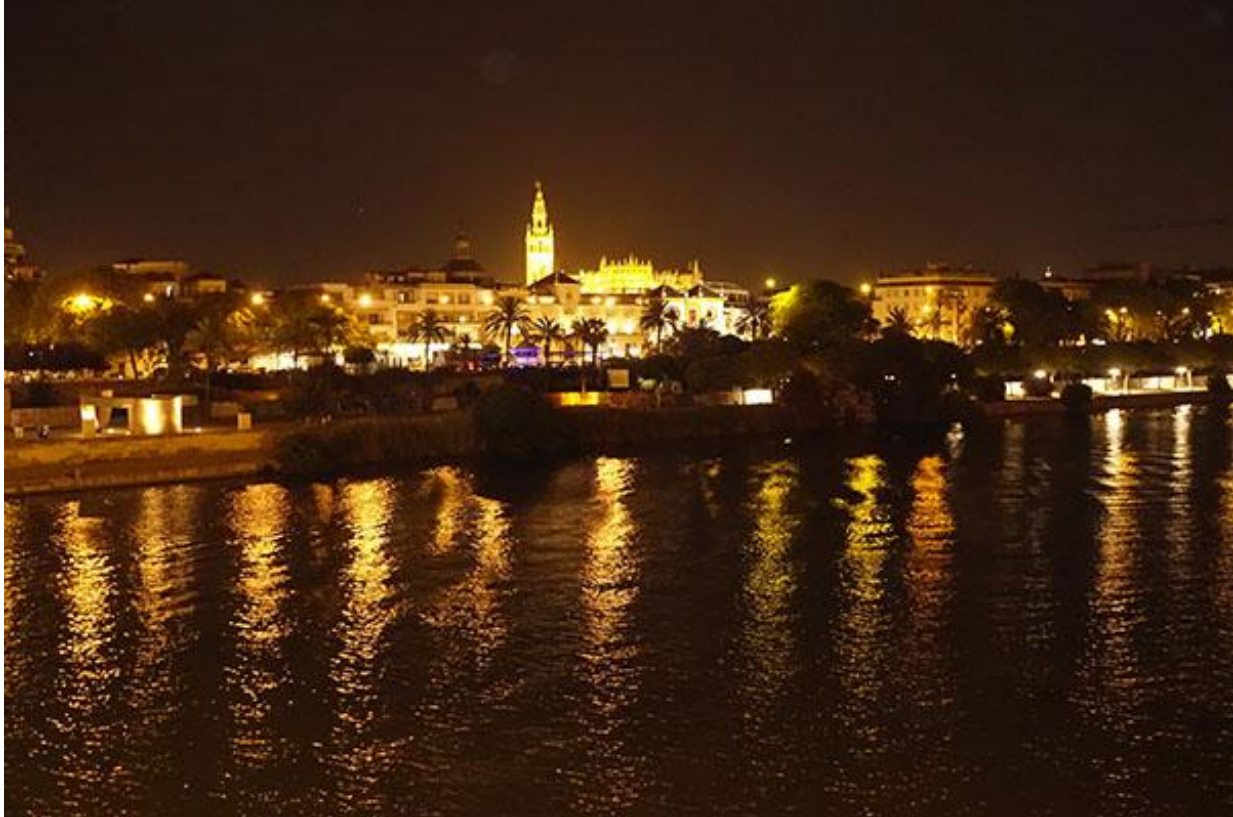
A night picture of central Sevilla, Spain from across the Guadalquivir River from which so many ships to the Americas departed.