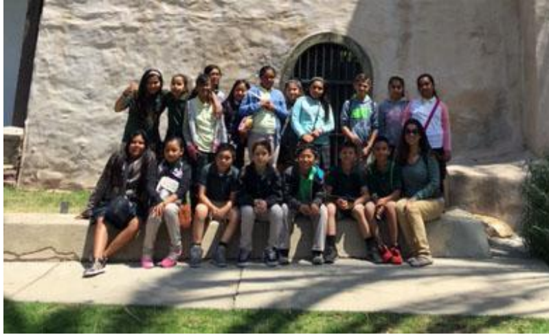
Clinton Elementary, Compton, visited Mission San Gabriel.

The Annual Application Window for 4th grade classes wishing to participate in the "All-Aboard-the-Bus" Field Trip Grant Program for the 2016-17 school year is open. For application details and program information, please visit the All Aboard The Bus section on the CMF web site.