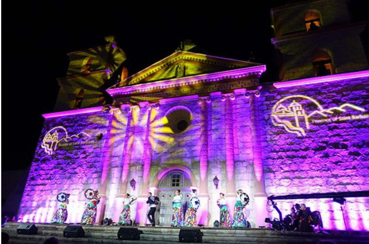
A beautiful evening at Old Mission Santa Barbara during Old Spanish Days Fiesta .