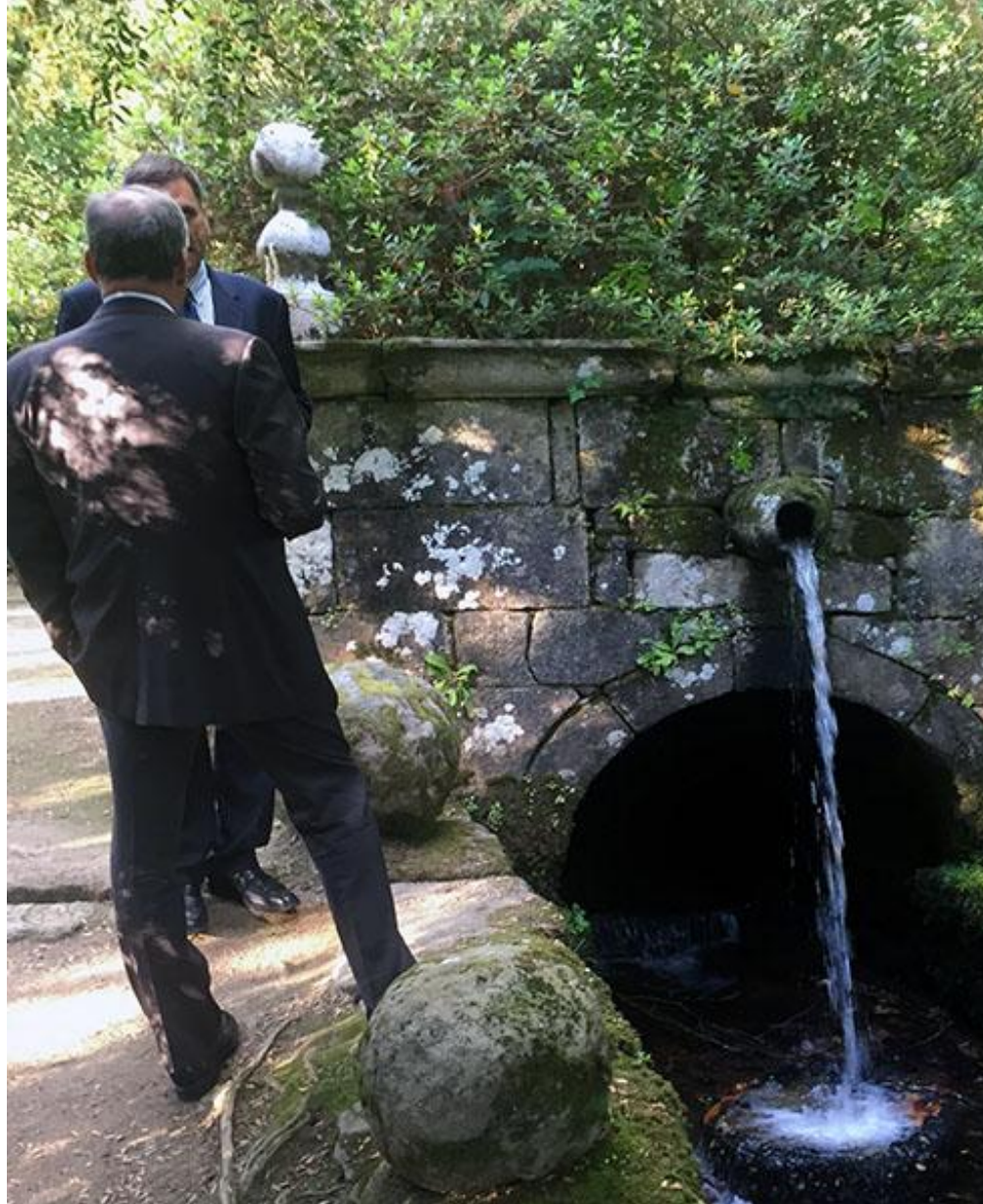
(Above and below) Discussing El Camino Real de las Californias Multi National Initiative with US Senator (D-Virginia) and Democratic Vice Presidential Nominee Mr. Tim Kaine.