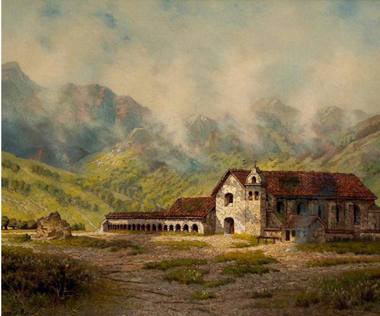
Mission Santa Ines.