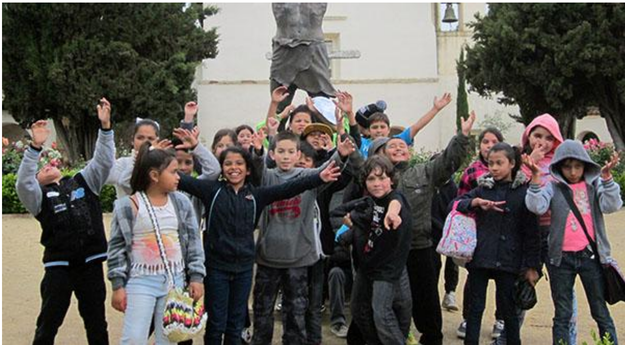
Ohlone Elementary, Royal Oaks, visited Mission San Juan Bautista.