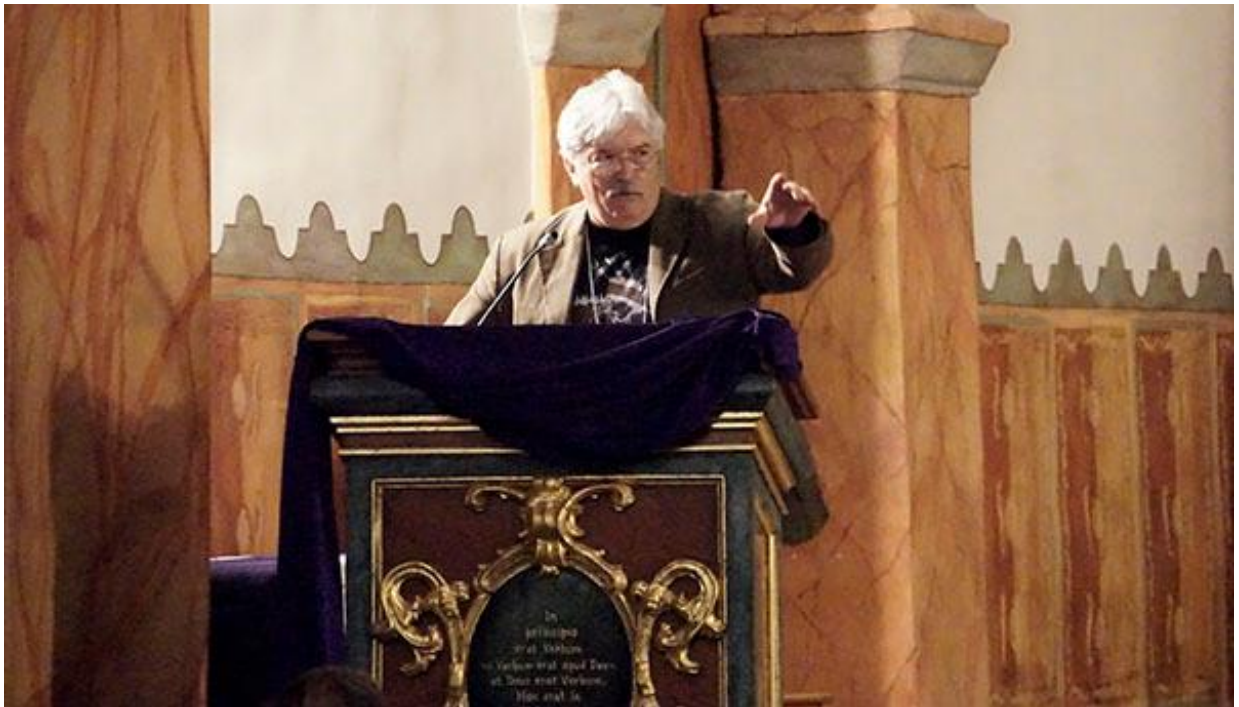
More than 20 presenters and panelists took part in the three-day Conference.

located on State Parks property. Saturday's Awards Banquet honored the top scholars and those who have dedicated their professional lives to CMF and to the preservation of the California Missions and related sites.