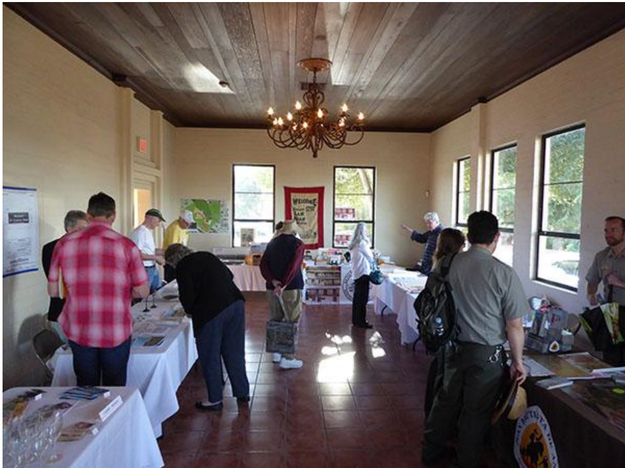
Book vendors at the 2016 California Missions Conference.

Mission San Juan Bautista and San Juan Bautista State Historic Park hosted this year's recent California Missions Conference. These venues served as a perfect backdrop for three stimulating days of Presentations, Tours, and the Awards Banquet.