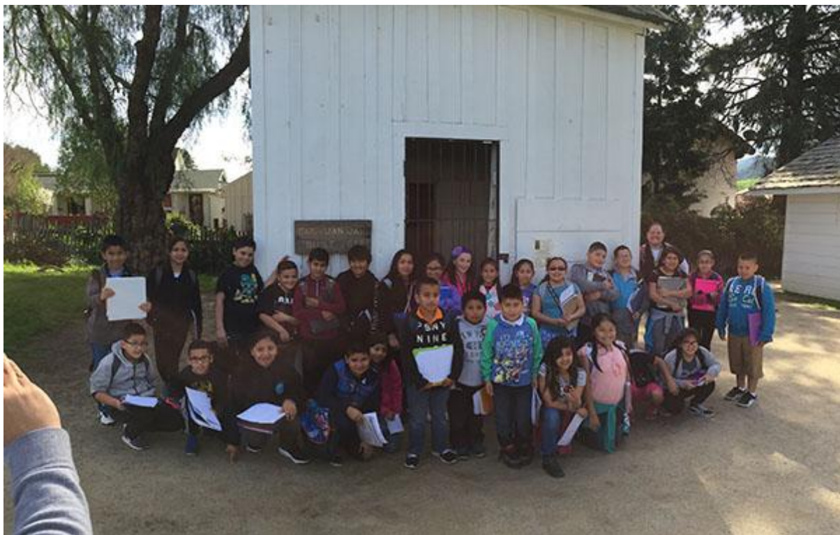
Students from Cesar E. Chavez Elementary School in Salinas