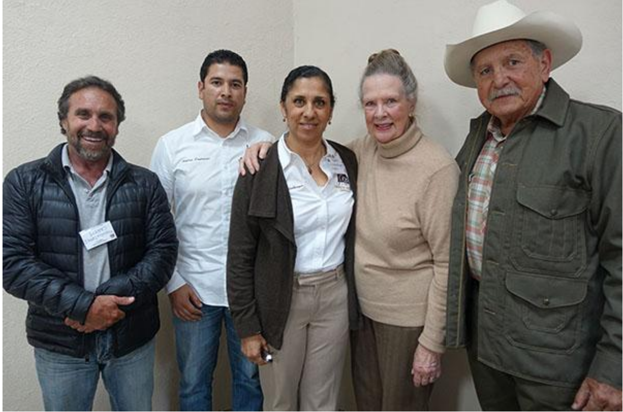
Members of CAREM, outstanding hosts for the two-day El Camino Real event.