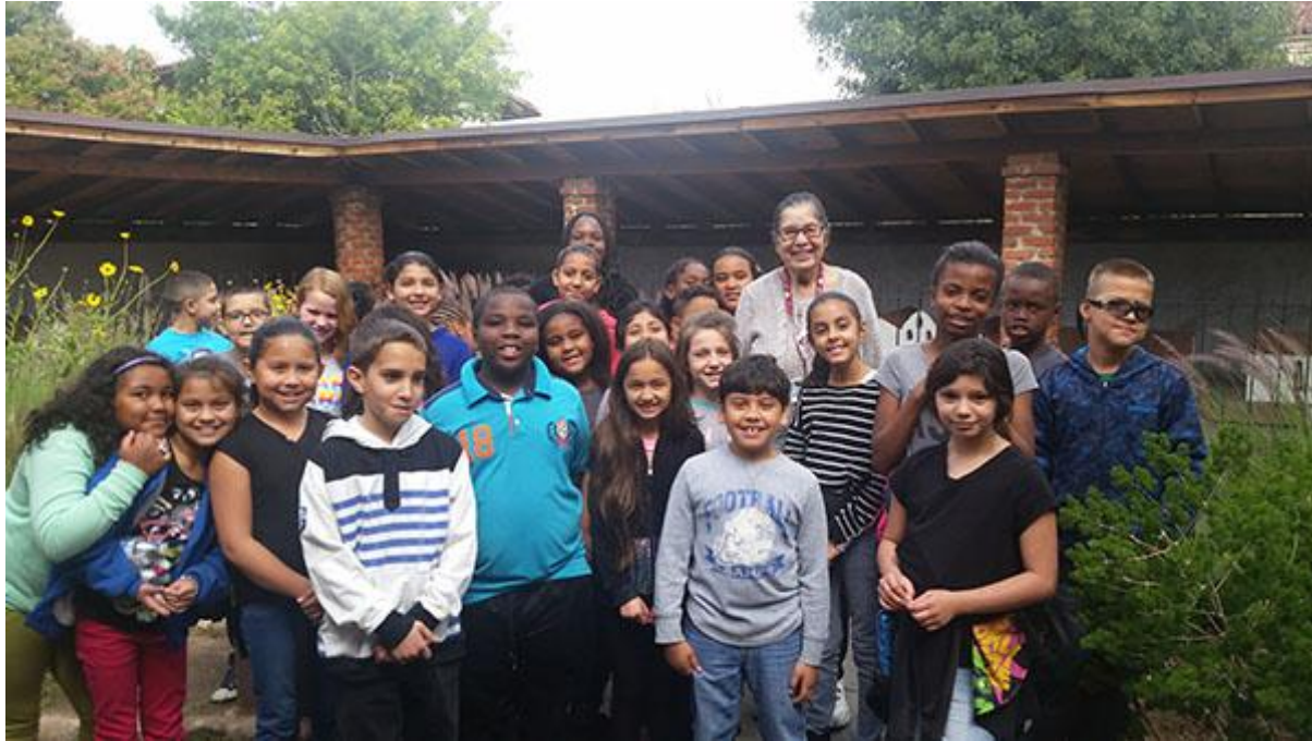
Students from Village Elementary in Victorville