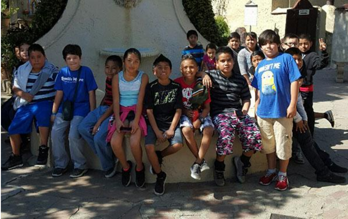
Students from Lincoln Elementary in Ontario

"This was the best field trip I have been on!" said a 4th grade student from Lincoln Elementary in Ontario after visiting Mission San Gabriel