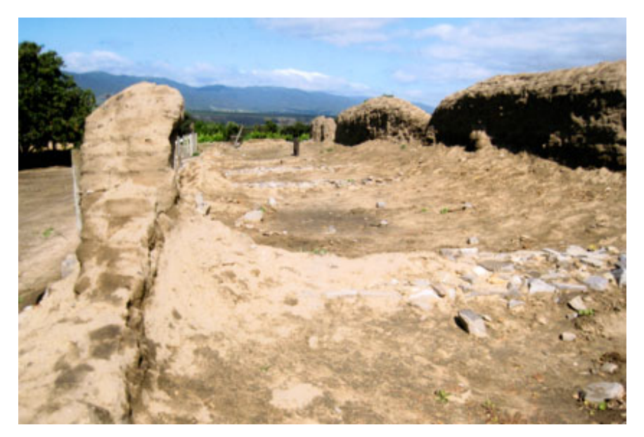
The North Wall (above) and Shelter (below) at the Soledad Mission

Above is an old photograph of the ruinous walls at the Soledad Mission. This photograph is included as a point of origin to show how the elements have eroded the adobe ruins over the years. We were quickly losing what was left of the north wall and wanted to try and preserve it for as long as we could as it is the last above-ground remnant made by the hands of those that originally lived at the mission. Below are photographs of the shelter under construction and the finished shelter