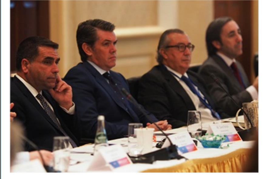
Members of the US-Spain Council, including CMF, participate in the Forum.

"There were a number of CEOs that were of Spanish descent and are operating companies here in California and other parts of the U.S. These CEOs were very interested in preserving one of Spain's greatest legacies in North America".