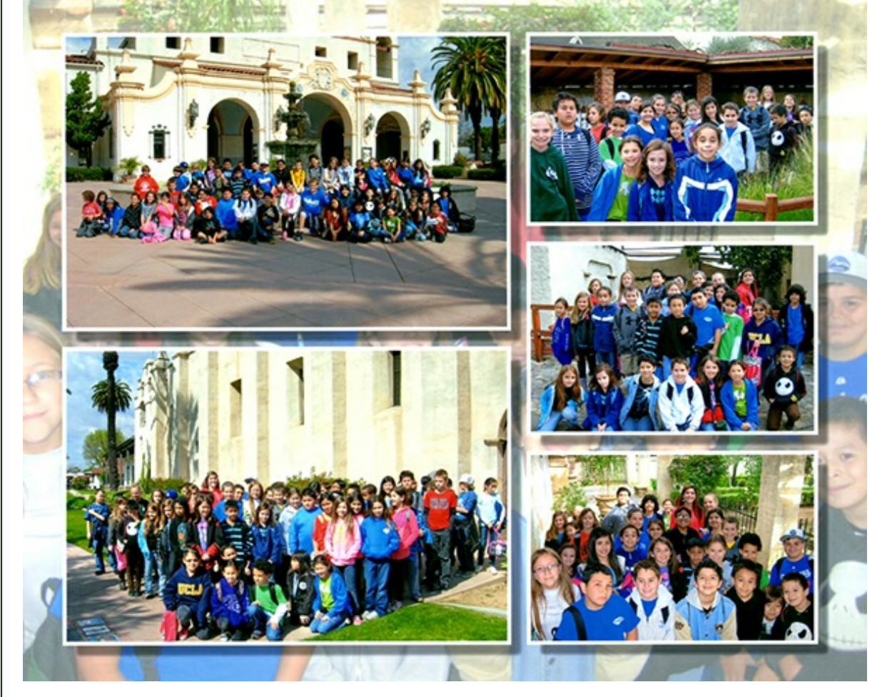
Students at Howard Wood Elementary School enjoy a field trip to Mission San Gabriel following a grant from CMF's All Aboard the Bus Program.