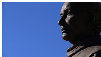
Images of Fr. Junípero Serra

In 2013, Mission followers around the world will join in the celebration of the 300th Anniversary of legendary Fray Junípero Serra's birthday and birth year.