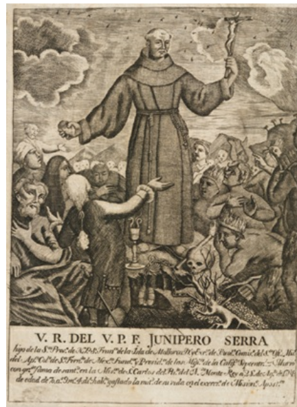
Francisco Palou, Relacion Historica de la vida y apolstolicas tareas del venerable padre fray Junipero Serra , 1787. Book, 8 ¼ × 12 in. open. The Huntington Library, Art Collections, and Botanical Gardens.

SAN MARINO, Calif.- The life of Junípero Serra (1713-1784)-and his impact on Indian life and California culture through his founding of missions-is the subject of a comprehensive, international loan exhibition this fall at The Huntington Library, Art Collections, and Botanical Gardens. The show runs from Aug. 17, 2013, to Jan. 6, 2014, in the Virginia Steele Scott Galleries of American Art.