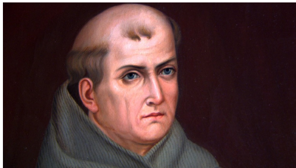
Portrait of Fr. Junipero Serra

To read flyer with more detailed information, please click here.