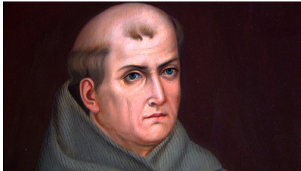
Portrait of Fr. Junipero Serra

October 2012, January 2013, February 2013, March 2013