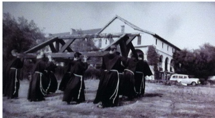
Circa 1957 - Seminarians carry the partially-completed creche to the front of the Mission.