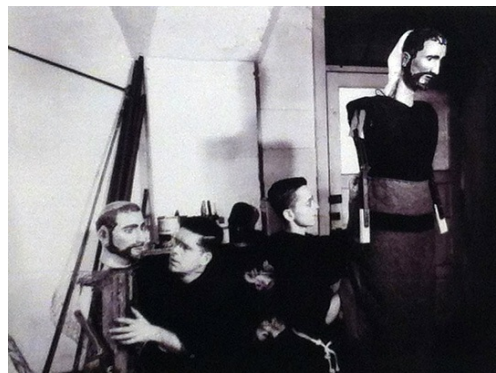
Circa 1952 - Seminarians work in the Mission Basement to create creche figures. These figures become part of the very first creche to appear in front of the Mission."

Buen Provecho! - CMSA's Food Corner - Pan de Caquis (Persimmon Bread) y Pan de Guayaba (Guava Bread)