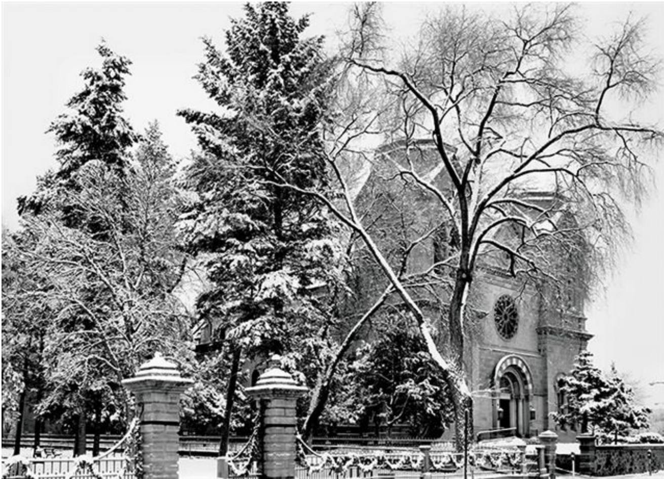
St. Francis of Assisi Cathedral Basilica, Christmas, Santa Fe, New Mexico 1997.