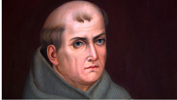
Portrait of Fr. Junipero Serra

October 2012, January 2013, February 2013, March 2013 RoadScholar www.roadscholar.org