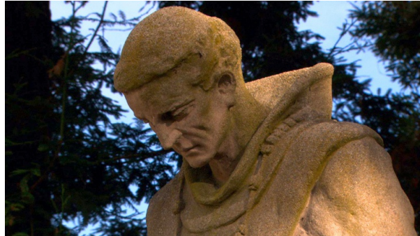
Statue of Fr. Junipero Serra

Mission San Buenaventura is offering a very fitting and exciting way to celebrate the 300th anniversary of the birth of Fr. Junipero Serra--The California Mission Cruise, a one-of-a-kind ocean voyage enabling up to 50 travelers to visit and learn more about six California missions, from April 6 to April 13, 2013.