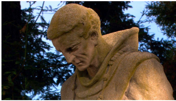
Statue of Fr. Junipero Serra

Mission San Buenaventura is offering a very fitting and exciting way to celebrate the 300th anniversary of the birth of Fr. Junipero Serra--The California Mission Cruise, a one-of-a-kind ocean voyage enabling up to 50 travelers to visit and learn more about six California missions, from April 6 to April 13, 2013.