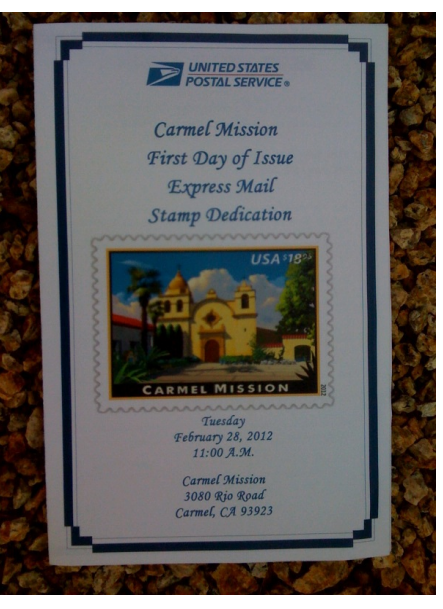
Photos of Carmel Unveiling Ceremony and of Carmel Mission Express Mail Stamp