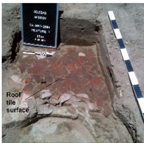
Figure 3: Tile surface at 0.25 m.

Other features included a courtyard surface of roof tiles, fragments of a steatite (soapstone) slab used for cooking, foundations whose bases tapered to a V, foundations with ledges on the interior, a adobe brick surfaces on the exterior of the west foundation of the church, and trenches filled with adobe brick fragments. The last feature, found on the last day, was a carefully made surface of small roof tile fragments (Figure 3). This was on the north side of the south wing with dozens of Mission Period ceramics and large fragments of mammal bone. This assemblage differs greatly from the rest of the site by virtue of the large size of the bone elements and the unusual assortment of ceramics. It is known that the deposit is just outside the quarters of the padres and may be associated with their day-to-day living. It is intriguing and may lead to more significant finds just below the surface.