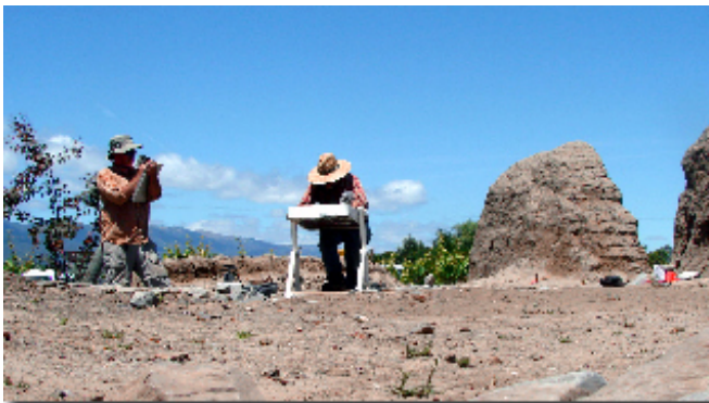
Crew working on the Mission Soledad North Wing

That's where the science of archeology comes in. The missions are of great interest to archeologists, providing them with a chance to study the economy, ecology, art, technology, and daily lives of those who inhabited these sites in the past.