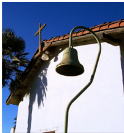
Mission Nuestra Señora de la Soledad

As funds permit, it is the Board's intention to expand and leave in place portions of this archeological interpretation, allowing future Mission visitors to experience "what was" as it is unveiled and delight in "living history."