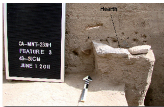
Figure 2: Hearth

One question, currently unresolved, is whether the mission was built on the location of a Native American settlement dating back to the prehistoric period. The investigation of the north wing found compacted floors at approximately 30 to 40 cm in all rooms. Remnants of a hearth (Figure 2) containing burned seeds, charcoal, and other materials were found in the easternmost room between 40 and 50 cm. This hearth may predate the Mission occupation. It was also found that Native American artifacts, mostly lithics (stone tools), increased at 50 cm and then declined in numbers to 150 cm, suggesting an earlier -- possibly prehistoric -- occupation. The plant material will provide a unique opportunity to study changes in subsistence, plant utilization, and botanical succession.