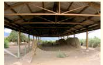
NORTH WALL BEFORE AND AFTER