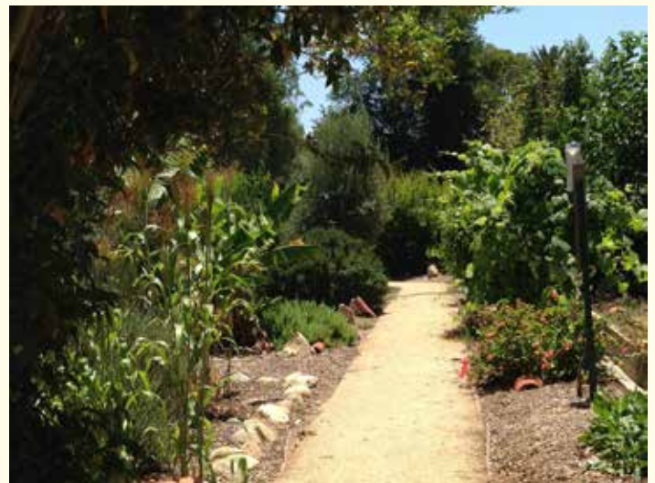
THE HUERTA HISTORIC GARDEN AT MISSION SANTA BARBARA

restoring the cultural landscape. Video clips of La Huerta plants and activities will be completed and properly edited to provide a website and computer on-site screen experience that will also be available online.