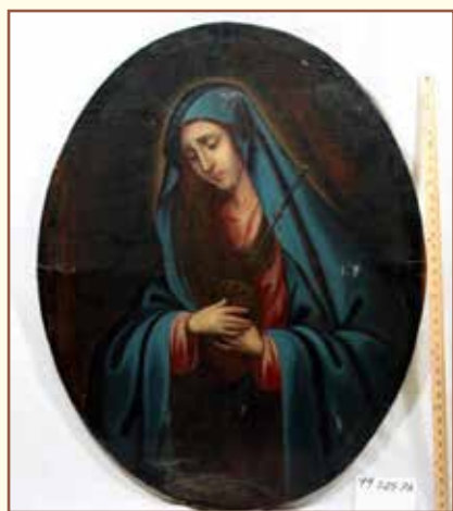
OUR LADY OF SORROWS

In 2013 the Mission's museum painting collection had a condition assessment performed as Phase I of a major conservation plan. In all, 31 paintings were examined: 16 paintings were designated as in 'urgent need', 12 received proposals for treatment, and one, a beautiful early 1800's depiction of Our Lady of Sorrows, was chosen for immediate restoration. The treatment consolidated flaking paint, removed old patches and adhesives, repaired distortions and tears, and repaired superficial grime and discolored varnish. Finally, appropriate varnish and protective backing were applied.