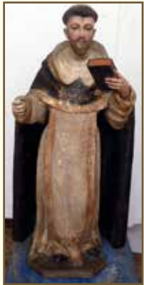
STATUE BEFORE RESTORATION

The santo, St. Dominic, from the 18th century Mexican period at Mission San Buenaventura was in need of complete restoration. Test cleaning was done in several areas of the sculpture, then various cleaning methods were used to safely remove the thick hard oil base paint that completely covered the statue. Repairs were made to damaged areas. Gilding and a protective coat of acrylic varnish was applied to protect all surfaces. The restoration was completed in November, 2014.