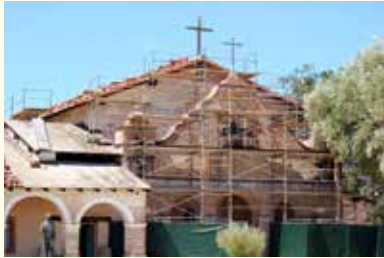
MISSION SAN ANTONIO DE PADUA

On August 4, 2014, work began on the first phase of the five-phase multi-year seismic retrofit project at Mission San Antonio de Padua. Four of CMF's partner foundations stepped up to help this important project: The Hearst Foundations, S.D. Bechtel, Jr. Foundation, Linden Root Dickson Foundation and the Field Foundation. The construction crew erected a series of wooden supports designed to shore up the lower roofs, enabling them to withstand the additional weight of the required incoming scaffolding. More than 200 vertical cores were drilled, followed by the installation of steel rods and anchors. The next step was the addition of epoxy and sand to the cores. Electrical rewiring brought the Mission up to current building code with vast improvement in usage and safety. Carpentry work on the Mission's front doors brought the site into ADA and Fire Code compliance. Next up -- Phase 2 of the massive retrofit project.