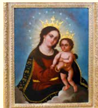
OUR LADY OF REFUGE PAINTING BEFORE RESTORATION (LEFT), AND AFTER (RIGHT)