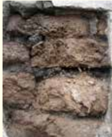
MISSION SAN FRANCISCO SOLANO CONVENTO EXTERIOR WALL

phase will include the installation of flashing above wood beams; installation of a French drain along the base of the wall to divert drainage water; the cleaning and the filling of large cracks and voids in the stucco; washing of biological growth; and finally applying an approved whitewash coating.