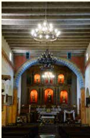
MISSION SAN JUAN BAUTISTA

Through a generous grant from The Charles D. and Frances K. Field Fund, the candelabras in the Mission San Juan Bautista church were rewired. A total of 20 candelabras had 198 base sockets replaced and refitted with socket covers. In addition, all 198 lamps were replaced with 4.5 watt candelabra LED flame-tip lamps. Each candelabra was rewired using a 16-2 black lamp cord. The candelabra project was completed in time for the Mission's much-anticipated holiday festivities.