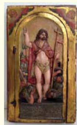
RESTORATION OF THE TABERNACLE DOOR AT MISSION SAN FRANCISCO SOLANO BEFORE (LEFT), AND AFTER (RIGHT)