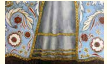
NUESTRA SENORA DE LA ESPERANZA BEFORE TREATMENT (LEFT), AND AFTER (RIGHT)

The retablos are a part of the Padre's bedroom exhibit. After thorough examination it was determined that there was a substantial amount of rust corrosion, areas of paint loss, small pin holes and surface dirt. The flaking paint was consolidated. The surfaces were cleaned of dirt and deteriorated varnish, treated for rust corrosion and coated with acrylic varnish on the surface for protection.