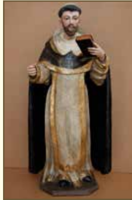
STATUE AFTER RESTORATION

The santo, St. Dominic, from the 18th century Mexican period at Mission San Buenaventura was in need of complete restoration. Test cleaning was done in several areas of the sculpture, then various cleaning methods were used to safely remove the thick hard oil base paint that completely covered the statue. Repairs were made to damaged areas. Gilding and a protective coat of acrylic varnish was applied to protect all surfaces. The restoration was completed in November, 2014.