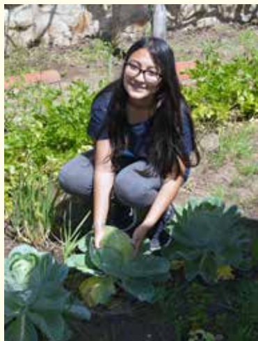
MINORCAN HENS BEING RAISED FOR INTRODUCTION TO THE PRESIDIO HERITAGE GARDEN (LEFT), AND HARVESTING CABBAGE IN THE GARDEN (RIGHT)