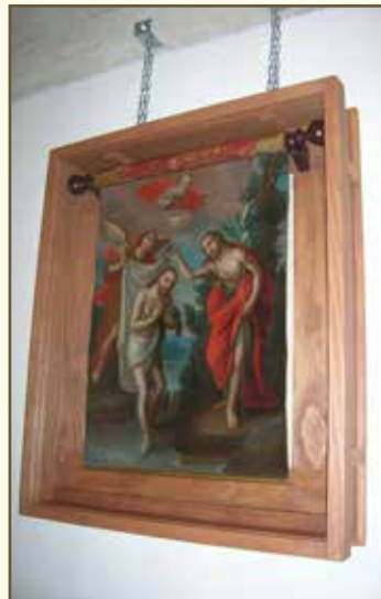
JOSÉ DE PÁEZ HANGING (LEFT), AND NEW SPECIALLY-DESIGNED BOX TO HOUSE THE HANGING (RIGHT) AT MISSION SAN LUIS OBISPO

age, and the other providing 99% UV protection. The box includes built-in backing that provides accessibility to the painting if needed. Also incorporated within the box is a niche that holds preservation materials that provide protection from bugs and humidity. This self-contained, environmentally-controlled display case allows the display of this California Mission treasure in a highly visible setting.