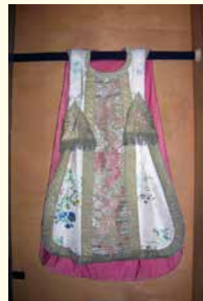
RESTORED VESTMENTS AT MISSION SAN LUIS OBISPO