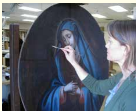
CONSERVATION OF OUR LADY OF SORROWS