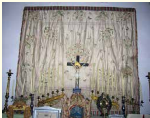
SILK ALTAR CLOTH RESTORED AT MISSION SAN LUIS OBISPO