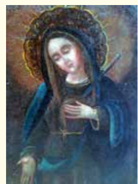
LA PURISIMA'S MADONNA WITH CROWN BEFORE RESTORATION (LEFT), AND AFTER (RIGHT)