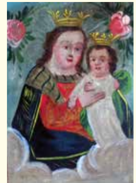
LA PURISIMA'S MADONNA WITH CHILD BEFORE RESTORATION (LEFT), AND AFTER (RIGHT)