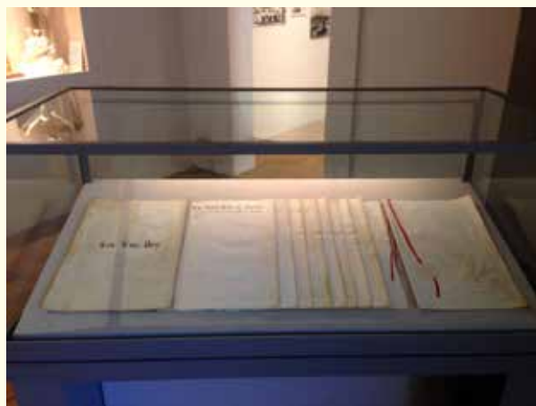
SPECIAL CASE HOUSING THE LINCOLN DOCUMENT

Old Mission San Luis Rey is remodeling and updating part of its museum. An entire redo of a room was done to house the historic and very fragile 13-page Lincoln Document in a special case, with specialized museum lighting and room protection. This original document, signed by Abraham Lincoln, gave the Mission church back to the Catholic Church. Mission San Luis Rey is one of the few missions that still holds its original document.