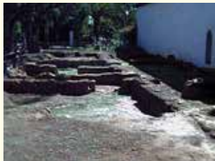
SPANISH COLONIAL CONVENTO WING

The Mission Basilica San Diego de Alcalá is preserving the architectural remains of the Spanish Colonial Convento wing. The site has been exposed to the elements for more than four decades. Continued exposure of the adobe walls has caused further deterioration. An important preservation study needs to