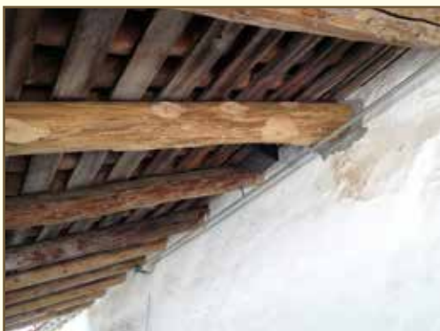
AT THE ASISTENCIA, LODGE POLES BEING PREPARED (ABOVE, LEFT), AND IN PLACE (ABOVE, RIGHT)

The entrance to the Chapel had been infested with termites. The termites had compromised the roof supports, creating a fear that, in the event of an earthquake, the weight of the roof tiles would have caused the roof to collapse. Over the summer, the existing roof was shored up in order to remove existing termite damaged lodge poles and underlayment. Four raw lodge poles were obtained from the forest near Julian. An expert came to the Asistencia to strip the knots, peel the bark from the especially chosen pine trees, and taper the poles from 10" to 6". The lodge poles match the older poles perfectly. The poles and underlayment were treated to discourage future termite damage. To complete the project, the chapel wall was patched and painted, and broken roof tiles were replaced with hand-made roof tiles from Mexico.