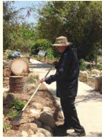
TENDING THE HUERTA HISTORIC GARDEN

The Huerta Historic Garden is a plant museum that is a repository of material and living artifacts from the Mission Era in California. The grant covered additional tools, seeds, records and educational exhibit/materials upgrades for the year.