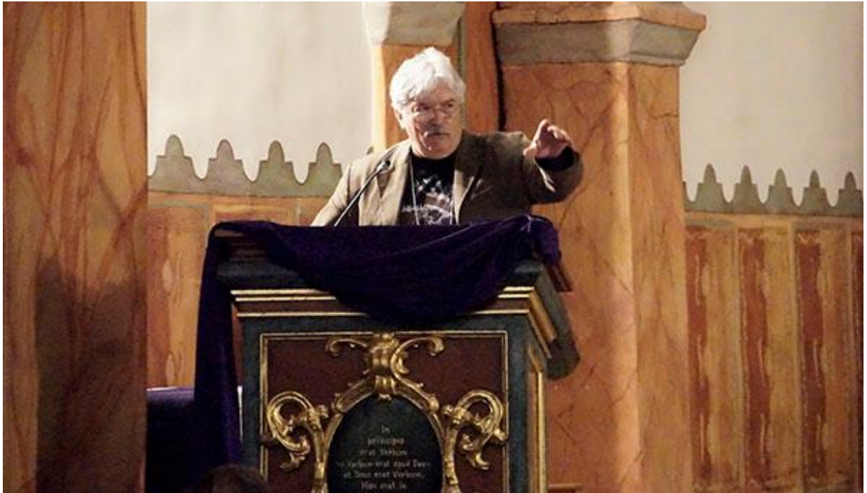
More than 20 presenters and panelists took part in the three-day Conference.

located on State Parks property. Saturday's Awards Banquet honored the top scholars and those who have dedicated their professional lives to CMF and to the preservation of the California Missions and related sites.