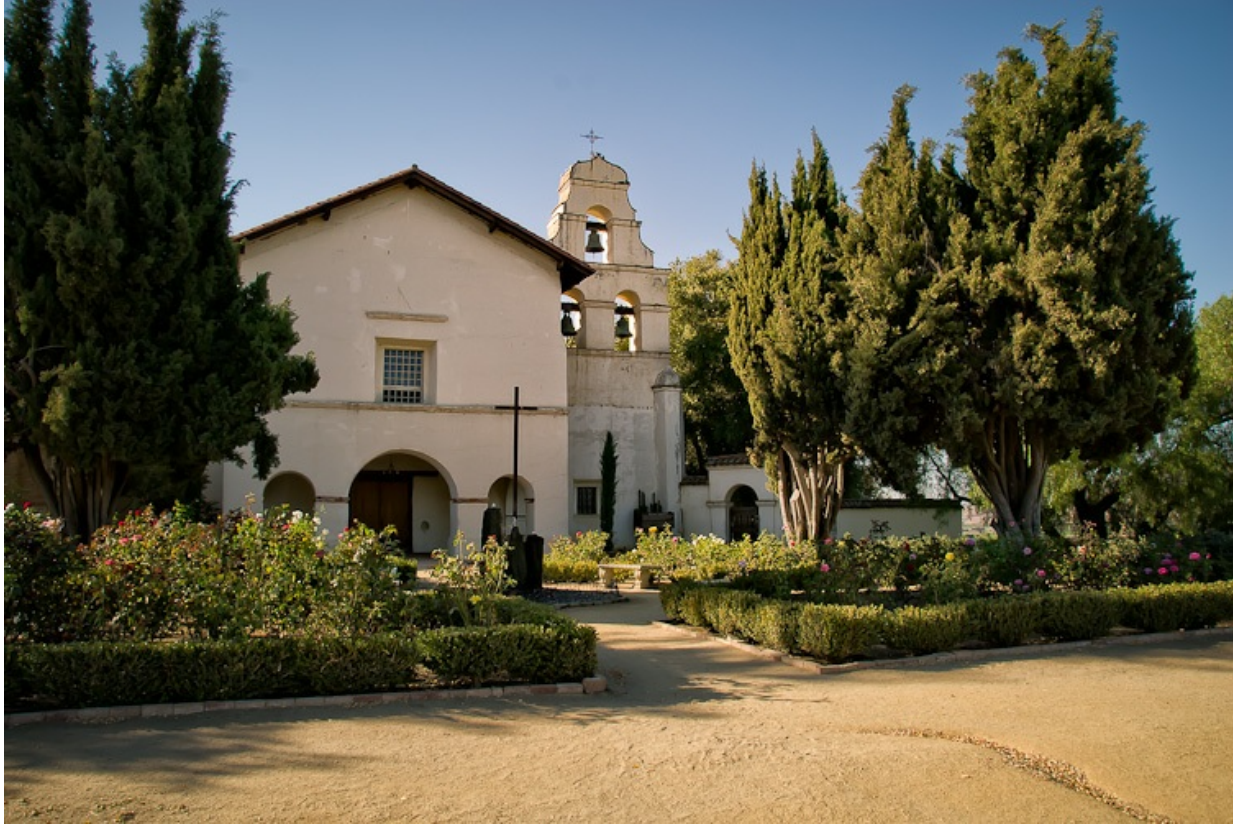
Mission San Juan Bautista. 33rd Annual Conference to return to SJB for first time since 1989.

The Board of Directors has unanimously chosen Mission San Juan Bautista as the host location for the upcoming Conference, scheduled for February 12-14, 2016. The three-day event, which begins on Friday and wraps on Sunday, will return to Mission San Juan Bautista for the first time since 1989 -- the sixth year of the annual gathering.