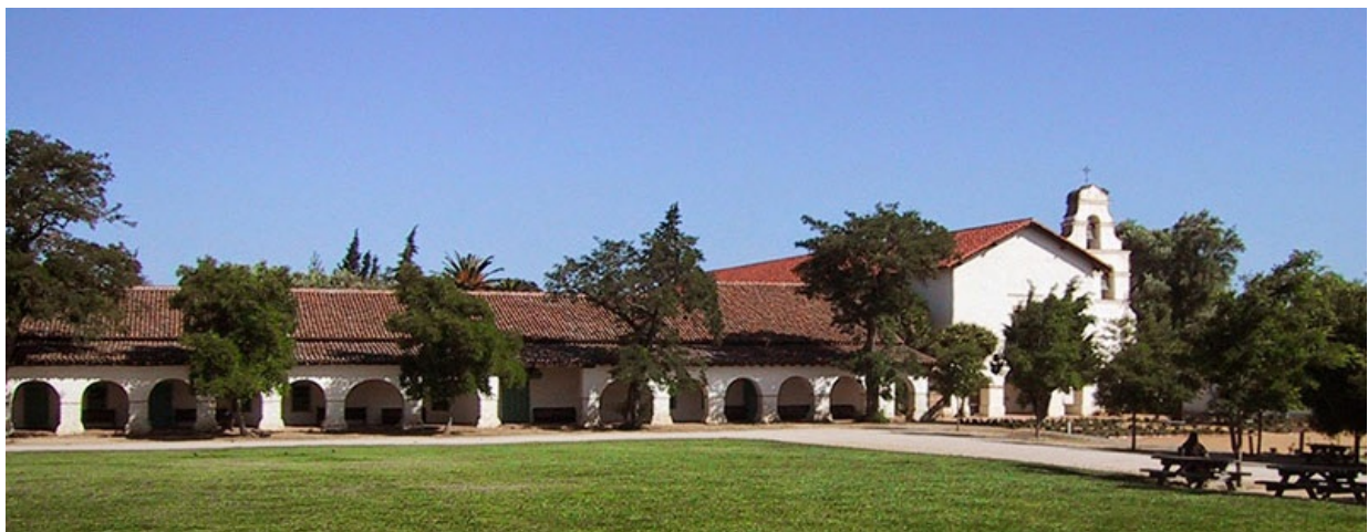
Mission San Juan Bautista. 33rd Annual Conference