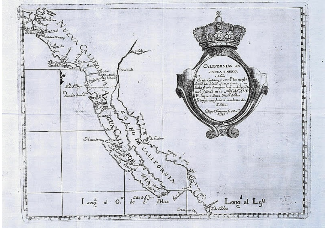
Map of Baja and Alta California.

The California Mission Studies Paper and Publication Committee has chosen, "El Camino Real de las Californias" as the theme for the upcoming conference.