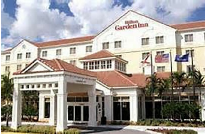
Hilton Garden Inn, Gilroy.

The Hilton Garden Inn in nearby Gilroy has agreed to be the host hotel for the 2016 California Missions Conference and is offering a special Conference rate of $129/night for Conference attendees.