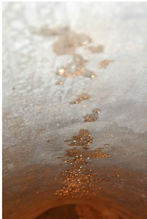
Moisture Damage in Crypt