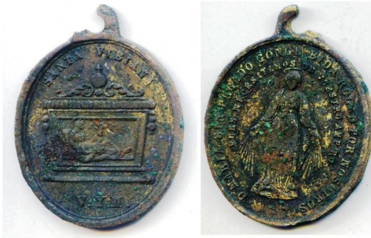
Figure 4: The St. Vibiana medal after cleaning.