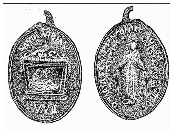
Figure 1: Drawing of the St. Vibiana medal made at the time of excavation.

After a preliminary cleaning of the medal, it was identified as a religious medal bearing the name and likeness of Santa Vibiana. Saint Vibiana was a third century Christian martyr buried in catacombs in San Sisto on the outskirts of Rome near the Appian Way. Her burial vault was rediscovered during excavations of the site which were authorized by Pope Pius IX in 1853. The unopened sepulcher was sealed with a marble tablet bearing the Latin inscription "To the soul of the innocent and pure Vibiana, laid away on the day before the kalends of September [August 31]." A laurel emblem commonly used for early Christian martyrs was found at the end of the inscription. After several weeks, an investigation led to the canonization of Vibiana. Clearly the medal bearing the name "Santa Vibiana" postdated her canonization.