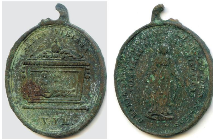
Figure 2: The medal before restoration.

After a preliminary cleaning of the medal, it was identified as a religious medal bearing the name and likeness of Santa Vibiana. Saint Vibiana was a third century Christian martyr buried in catacombs in San Sisto on the outskirts of Rome near the Appian Way. Her burial vault was rediscovered during excavations of the site which were authorized by Pope Pius IX in 1853. The unopened sepulcher was sealed with a marble tablet bearing the Latin inscription "To the soul of the innocent and pure Vibiana, laid away on the day before the kalends of September [August 31]." A laurel emblem commonly used for early Christian martyrs was found at the end of the inscription. After several weeks, an investigation led to the canonization of Vibiana. Clearly the medal bearing the name "Santa Vibiana" postdated her canonization.