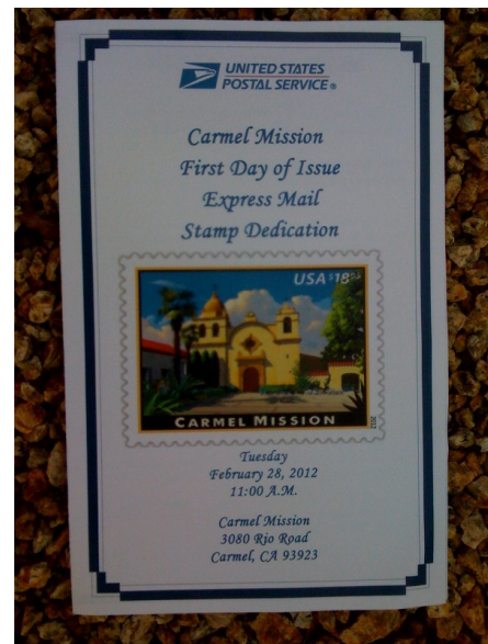
Photos of Carmel Unveiling Ceremony and of Carmel Mission Express Mail Stamp