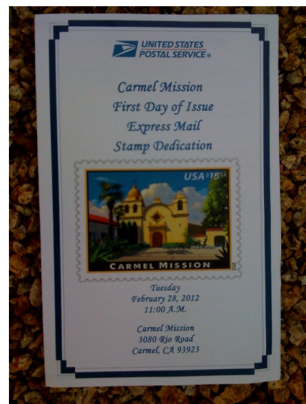
Photos of Carmel Unveiling Ceremony and of Carmel Mission Express Mail Stamp